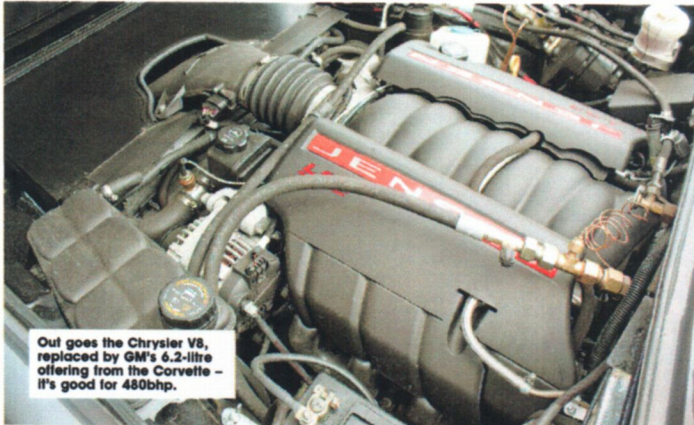
Out goes the Chrysler V8, replaced by GM's 6.2-litre offering from the Corvette - it's good for 480bhp.

entering one of those old buildings that has been refurbished for a new purpose in life, a London docklands warehouse given a makeover for modern living. The previous fabric remains; there's that distinctive slab of plastic dashboard, its supplementary centre gauges angled towards the driver as if in collusion against nosy passengers. Switches are traditional chunky and, on this car, there's a drilled Moto-Lita steering wheel matching the black leather upholstery and polished aluminium-finished centre console. It's when you look closer that the 21st century starts to come out of hiding. Least subtle are the modern gear selector knob and the mid-mounted 'engine start' button that glows blue when the ignition comes on. More discreet, immediately below that, is the retro-looking Becker Mexico entertainment system concealing CD and satellite navigation options, plus the speedometer with a digital odometer on its otherwise old-fashioned face.