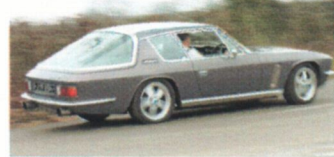
It may be a grand tourer, but the tweaked suspension means that this Interceptor handles like a sports car.