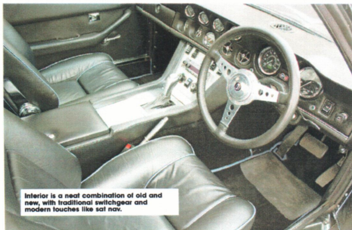
Interior is a neat combination of old and new, with traditional switchgear and modern touches like sat nav.

Chrysler has been usurped by Chevrolet under the bonnet, with a General Motors LS3 V8 shoehorned in. That sounds less impressive than saying it's the same engine that the current Corvette uses, a 6.2-litre unit offering, on this particular example, an utterly mad 480bhp, with a top speed in excess of 160mph and a 0-60 time of 4.5 seconds. Helping to channel all this brute force is a GM four-speed electronic automatic transmission, while doing their best to try and keep any inexperienced new driver on the road and out of trouble are a heavily revised suspension (including a limited-slip differential and Jaguar independent rear set-up in place of the old occasionally dicey live rear axle) and high-spec disc brakes. In short, Jensen on top, Chevy-powered Jag underneath. Sort of. Opening the wide driver's door is like